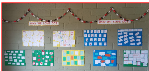
Ex-students left and right. The children's writing and drawings of what they love about DCS.