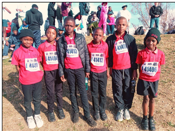
Left: Some members of our Cross Country Team who competed across several events.

If you would like to know more about sponsoring a child at DCS, please go to our website: www.dihlabengschool.com or email direct either the school in South Africa, or New Life Church in the UK. (See top of newsletter).