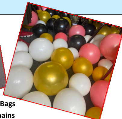
Balloons and Party Bags Cakes and Paper Chains