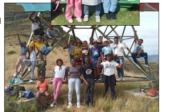
Below - Grade 6 climbed Mt Horeb

As well as these events, Grade 6 did a sponsored climb of our local Mt Horeb to raise funds for their residential trip to the Drakensburg, in Term 3. We have had a sponsored 'Spell-a-thon', Valentines Day, and our Pre-Primary children went on a 'Bear Hunt', and had a visit from a Bear! These few photos give you a flavour of some of the activities. Thank you to all the staff who have helped to make learning at DCS so much fun.