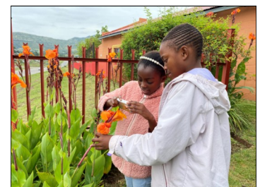
Working on the photography/art project