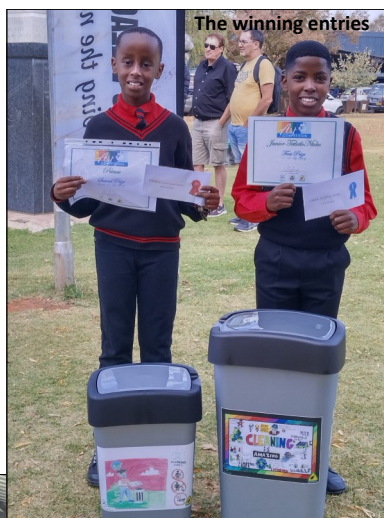
The winning entries