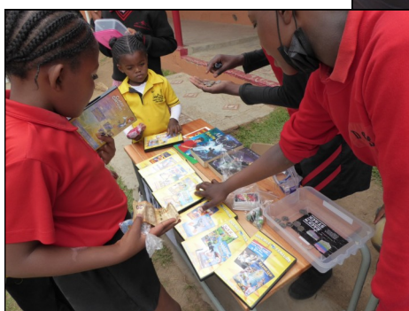
Toys, books and games all for sale at very reasonable prices.

'Eco Schools is an international programme aimed at encouraging young people to think about the positive actions they can take to look after the environment. We started the programme back in 2018 by thinking about how we could be more intentional about recycling. Each year we have chosen an extra theme to work on, as well as continuing with themes introduced previously. We are currently working on five themes including, Recycling, Health and Well-being, Culture and Heritage, School Grounds and Energy. As well as teaching on these subjects in class, we try to celebrate special days in the calendar such as, 'Clean up and Recycle Week'! This next year we are working towards our Gold Award.