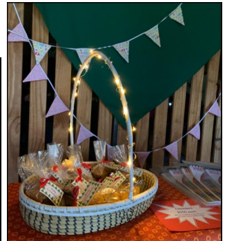
We also held a small Christmas Market with gifts and treats made by the children and staff to raise money for the school.

Nativity 2022 'The Sleepy Shepherd' - After two years, it was such a treat to have our Foundation Phase children perform their Nativity play once again. This year it was on the theme of 'The Sleepy Shepherd' who was so sleepy he nearly missed the big event in Bethlehem! This is a date in the DCS calendar not to be missed! The children were amazing - as always. Well done to staff and students.