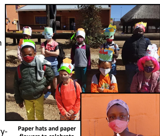
Paper hats and paper flowers to celebrate 'Spring Day' on 1st September

In this context, we have striven to make DCS a haven of normality as far as possible. Of course, there have been changes, such as mask wearing and sanitising everything that moves, and many things that don't. We have become so used to wearing masks that we sometimes forget we are wearing them. One teacher joked that we should see if we were eligible for a Guinness World Record for longest mask-wearing whilst at school!