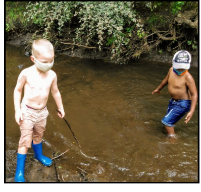
Grade R end of year outing to Sunnyside Farm - playing in the river

Prize-giving was very different this year. For starters, we held it outside, under parasols to provide some shade. In the end, we celebrated nine separate times, once for each grade, including a special 'Awards Evening' for Grade 7 and our trophy winners. It was not quite the raucous event that we are used to having but parents were appreciative of the effort.