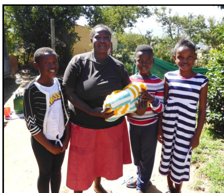
Top Left - The DCS Community Club with members of the Itumelang Centre

Some members of Community Club also helped to identify needy people in their neighbourhood to whom we were able to give some beautiful blankets that had been knitted by members of the 'Connect' group who meet together at New Life Church, Biggin Hill, in the UK. More blankets were also given out through Dihlabeng Church. It was lovely to be able to involve the children in thinking about others in their community who are in need.