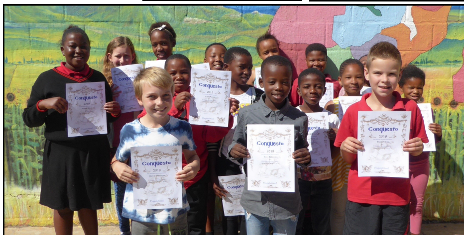
Our Top Achievers in the 2018 Conquesta Maths Competition