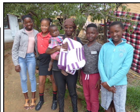
Community Club members giving bright colourful blankets to people in their neighbourhood.