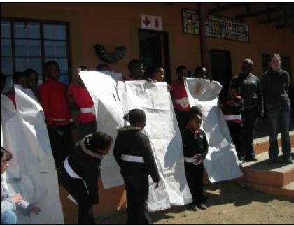
Grade 2 used the story of Jack, or in their case, 'Jim' and the Beanstalk to learn about measurement. They made some big life-size charts.