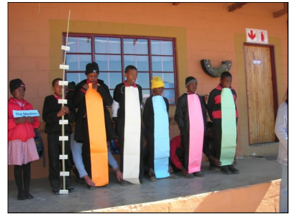
Grades 6 and 7 both studied data handling in different ways. Grade 6 (above) made a human bar chart and Grade 7 (below) focused on how to calculate the 'mean', 'median' and 'average' from a given set of statistics.