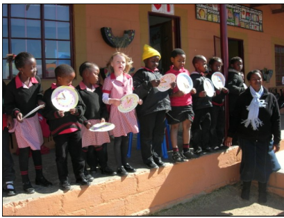
Grade R - Work on Time and Clocks