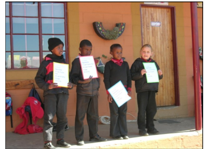
Grade 3 focused on multiplication using a story with a Pancake recipe, the quantities of which they multiplied for large numbers of people.