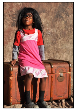
The Children Dressed Up for Funny Clothes Day