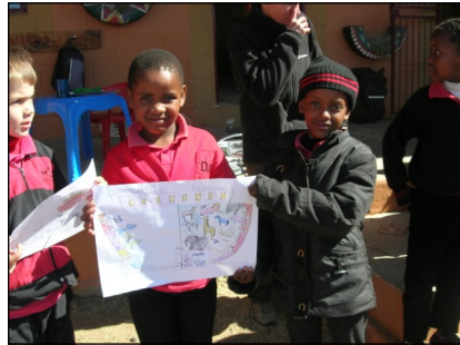
Grade 1 used the story of Noah's Ark to think about grouping and sorting animals with different attributes, and multiplication.