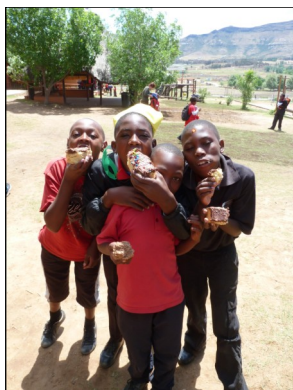
There's nothing boys like better than cake!