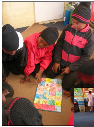
Grade 4 made maths board games played with dice and counters which they took to Grade 1 and 2 and taught them how to play. Good experience in being both pupils and teachers.