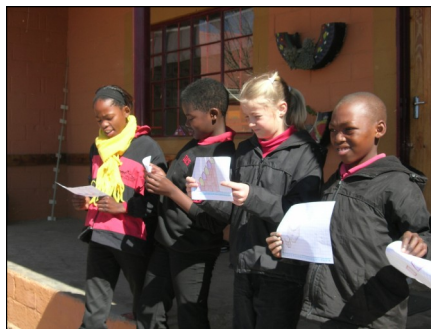
Grade 5 used co-ordinates to draw shapes on a grid, then by changing the co-ordinates in set ways, learnt how to enlarge, translate and rotate the shapes.

Maths Week for the whole school produced a wonderful range of maths activities that the children studied during their maths lesson time and then presented to the whole school in our Friday assembly. This provided a fun way to learn about practical maths topics and activities.