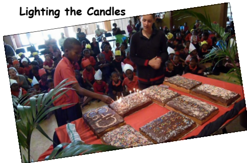
Lighting the Candles