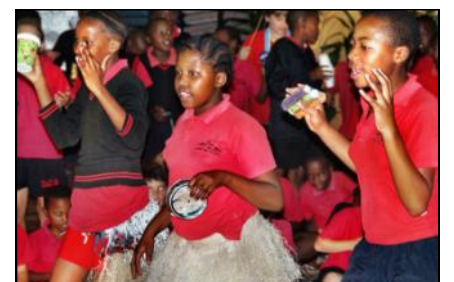
Homemade instruments for rhythm and dances created by the children.