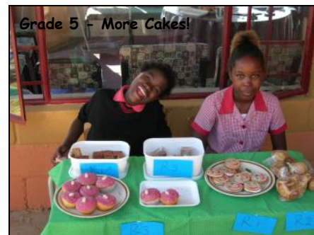
Grade 5 - More Cakes!

The children and staff have been busy raising money for the school and other causes. The Sponsored Spell and Entrepreneurs Day, which teaches the children how to cost and budget a small business venture, raised money towards new computers and end of year outings. They also gave 10% of the money to Clarens Combined School.