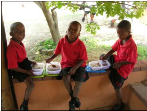
Three boys enjoying their lunch.