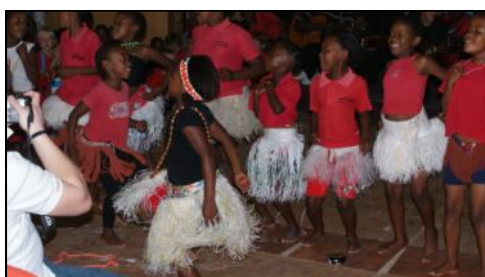
Performing the Concert with the Red Oaks team.