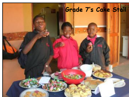
Grade 7's Cake Stall