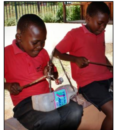
A clever instrument made from a milk bottle and some bottle tops.