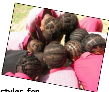
New Hairstyles for a New Term!