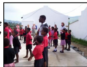
Praying For Funds