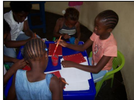
Art and Craft