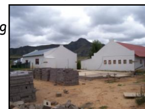
The Next Stage Begun