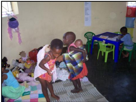
Carrying the Babies - Just Like Mum!