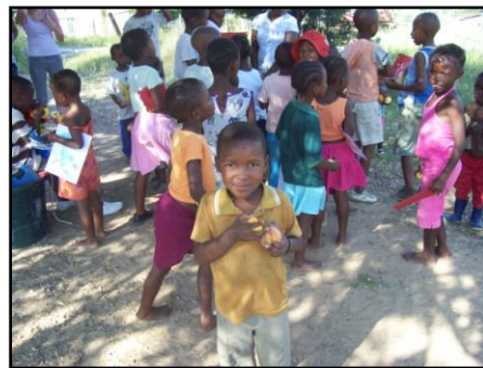
Taking Peaches Home