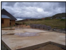
Foundations are laid