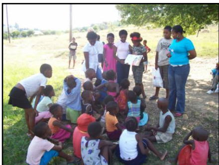
The Team From DCS Read a Story