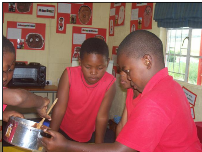
The boys cook up something chocolaty!