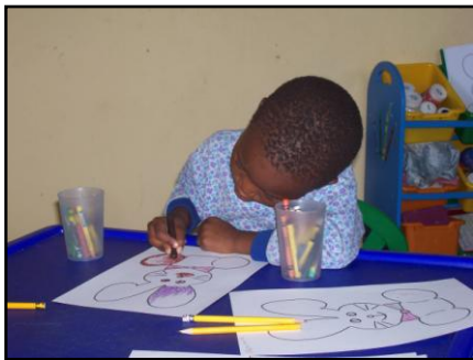
Learning to Use Crayons