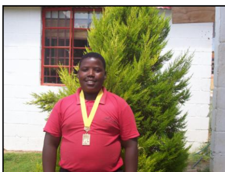
Mokone Grade 6

'The family just keeps growing and we love them all!'