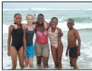
Grade 6 2011

In October Grade 6, the smallest class in the school, made a 4 day trip to Durban. They stayed at Illovo Beach and enjoyed time on the beach and in the sea. This was the first time some of them had seen the ocean. They also visited Ushaka Marine World and took part in a Hip-Hop dance workshop. The children's own fund raising helped to pay for this trip.