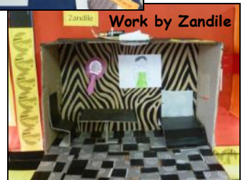
Work by Zandile

Natural Science/Technology - Electricity. Designing and making a shoe box room with a working light circuit and switch. Also, the class display was lit up to show their work on Electrical Circuits.