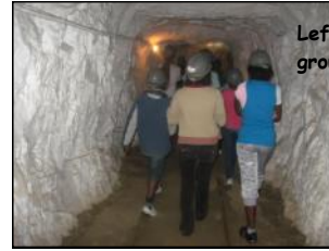
Left: Visiting the Underground Mine Workings

Grade 7 (12 pupils) had a two day end of year trip to Gold Reef City, near Johannesburg. The tour around the Gold Mine added information and experience to their curriculum work on the mining industry, and the theme park rides allowed them to challenge gravity and test their nerves (and stomachs!) to the utmost. It was a most enjoyable and popular trip.