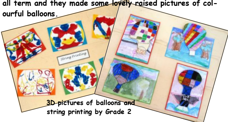
3D-pictures of balloons and string printing by Grade 2

Grade 2's theme has been 'On The Move'. They have studied many different forms of transport and the history of flight. They enjoyed a visit to the airport in Bethlehem to find out how aeroplanes take off and land. Their papier mache Balloons have decorated the ceiling of the classroom all term and they made some lovely raised pictures of colourful balloons.