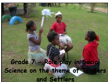
Grade 7 - Role play in Social Science on the theme of Traders and Settlers

Maths Week - Grade 6 took the theme of 'Circles'. Their work included plotting and measuring giant circles on the field, parts of a circle, using compasses and best of all, making pizzas!