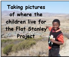
Taking pictures of where the children live for the Flat Stanley Project

Grade 4 also performed a dance from the story 'Kuyanda's Story' called, 'A Promise to the Sun'.