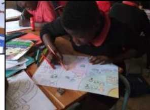
Art work on the theme of One World