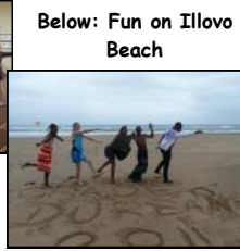
Below: Fun on Illovo Beach