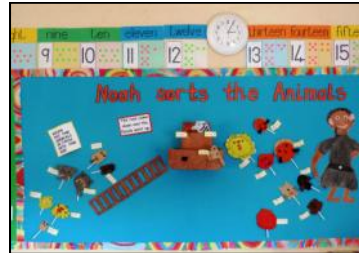
Counting the animals in Noah's Ark