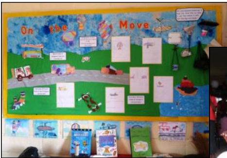
Class display on different types of transport