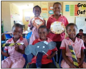
Grade 1 pupils with their Animal Masks (left and bottom right) and their technology project of animal puppets.