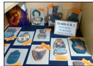
Grade 6 and 7 Technology-Designing Clay Pots.

Natural Science/Technology - Electricity. Designing and making a shoe box room with a working light circuit and switch. Also, the class display was lit up to show their work on Electrical Circuits.