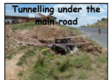
Tunnelling under the main road

Completing both these big projects in one year is fantastic and we are very thankful to God and to everyone who has contributed.