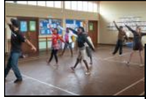
Above: The Hip Hop Dance Workshop