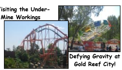
Defying Gravity at Gold Reef City!