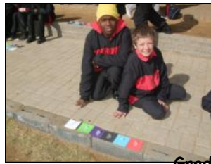
The Ice Experiment Grade 5 Science 'Energy'