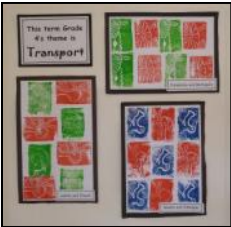
Art - Printing by Grade 4