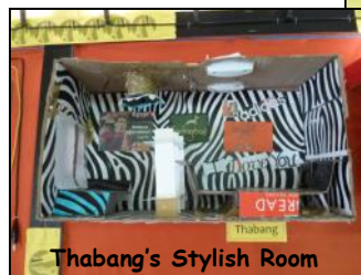
Thabang's Stylish Room