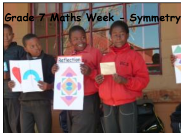
Grade 7 Maths Week - Symmetry