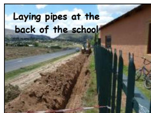
Laying pipes at the back of the school