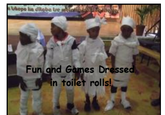
Fun and Games Dressed in toilet rolls!