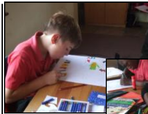
Left: The 3 Prize Winners