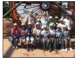
Grade 7 2011