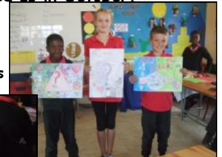
From the left: