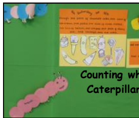
Counting what the Caterpillar ate.