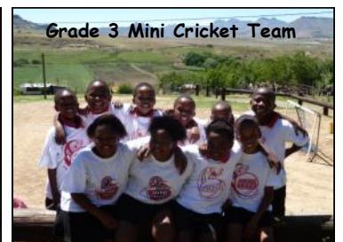
Grade 3 Mini Cricket Team